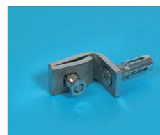
Fence connection clip