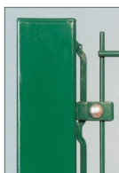
Fence connection strip